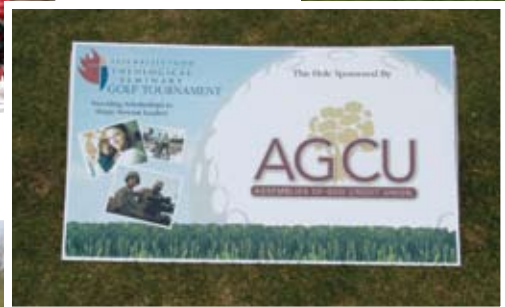
Several local businesses and churches sponsored the tournament. AGCU was the Platinum Sponsor.